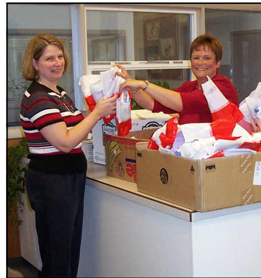
Coos Bay Soroptimists package dental kits for the Ready to Smile Program