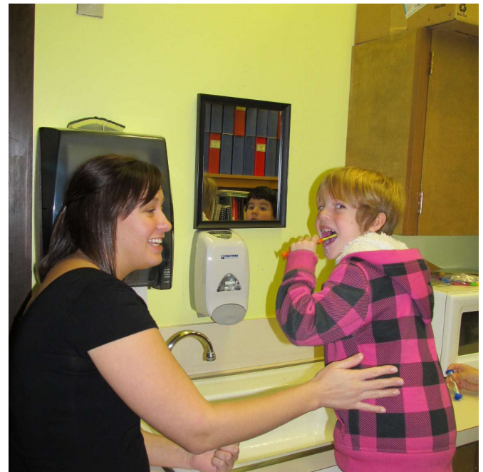
Student receiving brushing instructions at Riley Creek School in Gold Beach