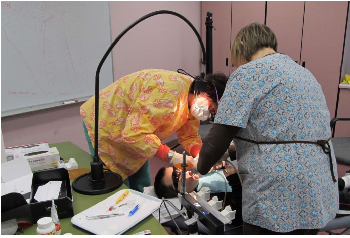
Dental Team at Riley Creek School, Gold Beach