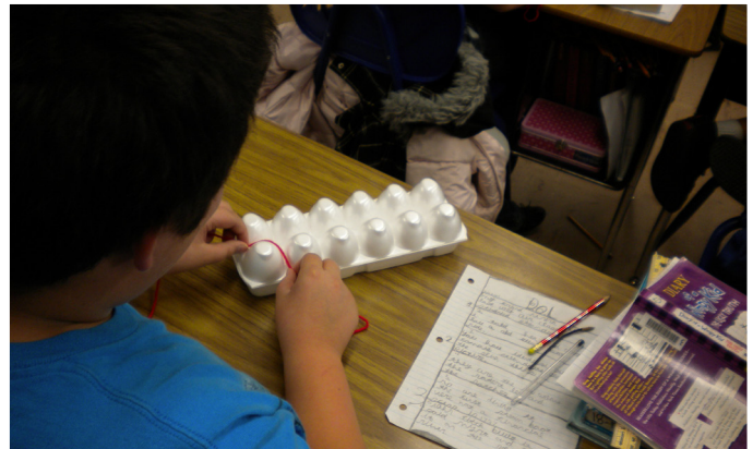
Learning how to floss.

January Coos County, Gold Beach and Brookings